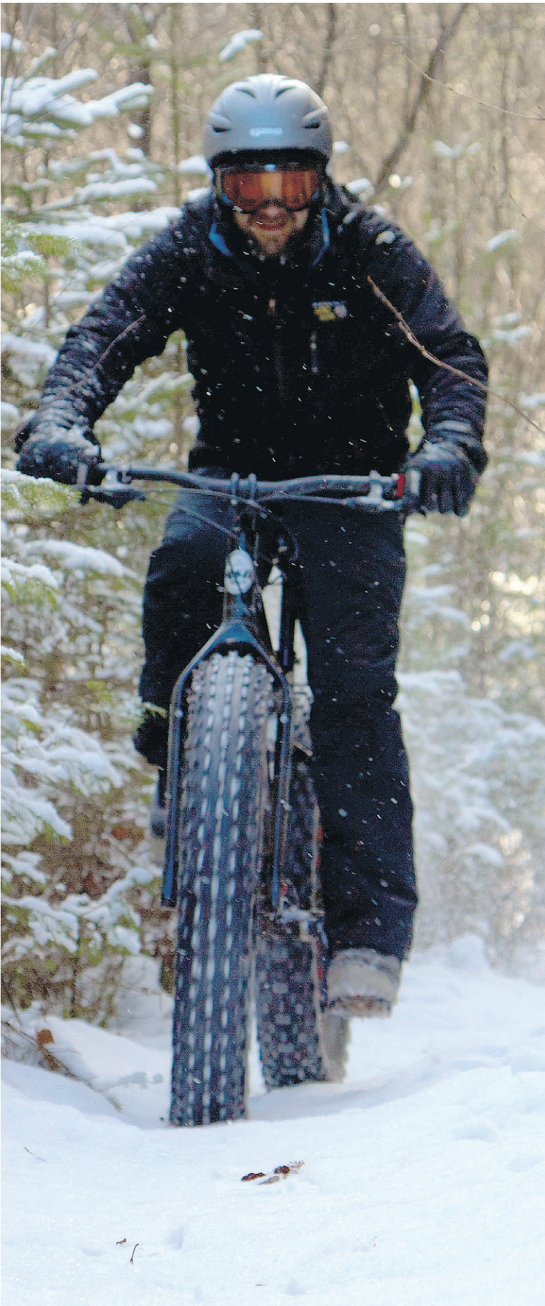
Mont Sainte-Anne has created groomed trails for a thrilling new activity – fat-biking through the snowy woods. The trails all depart from the St-Julien Main Lodge.

Mont Sainte-Anne creates three groomed loops that add up to 11 kilometres for riders